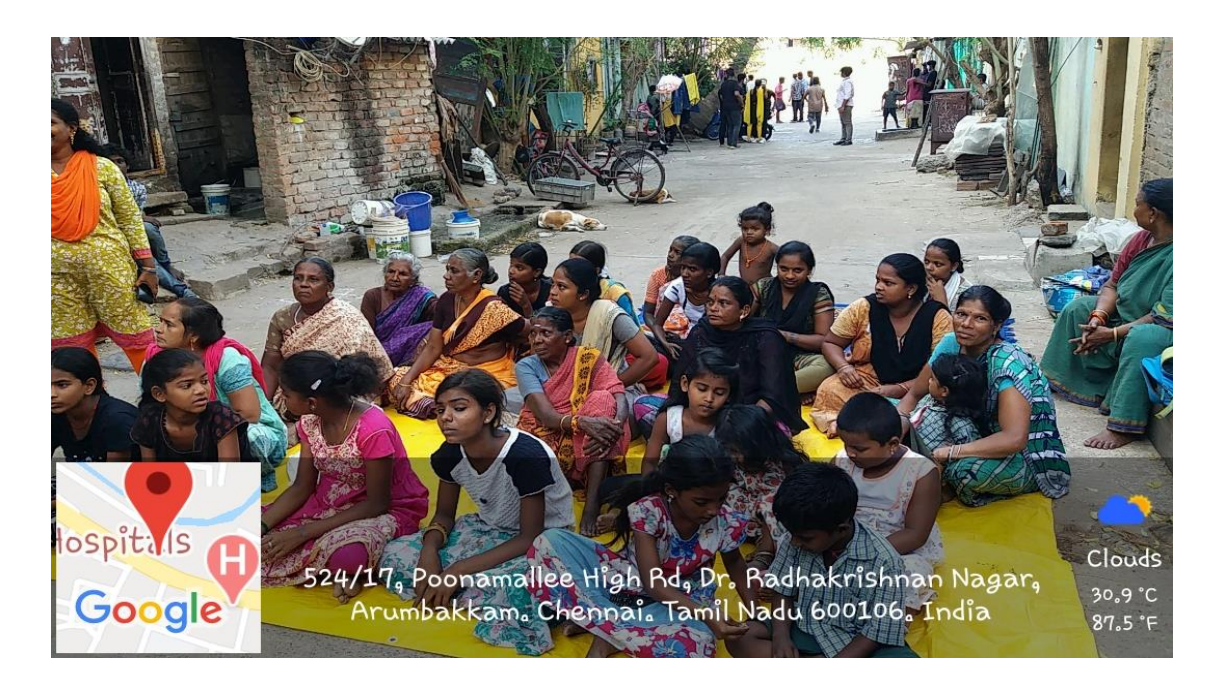
The beneficaries of the program